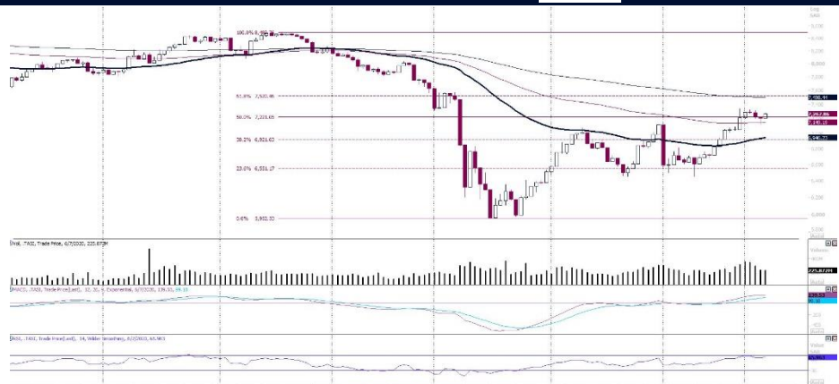
TADAWUL ALL-SHARE INDEX - DAILY CHART