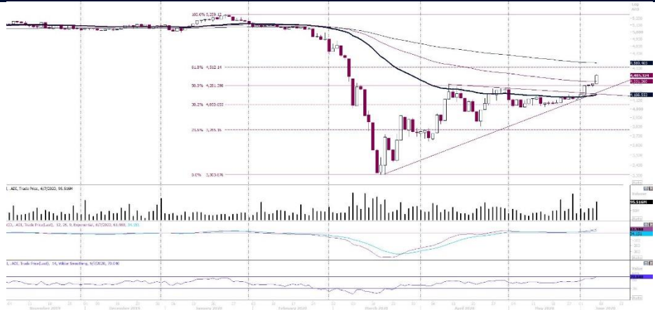
ADX GENERAL INDEX - DAILY CHART