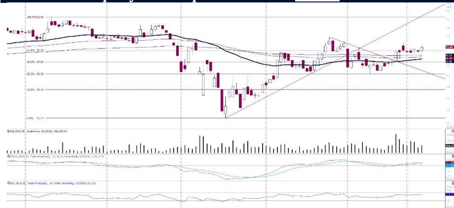
Company for Cooperative Ins. - DAILY CHART

There is a conflict of signals; the Index remains below its 200SMA but has been moving upwards.