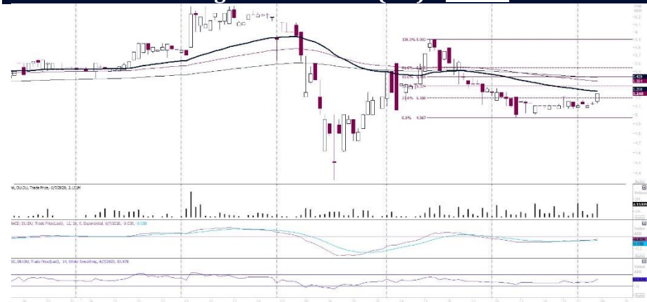
Emirates Integrated Telecom (DU) - DAILY CHART

The Index seems to be moving upwards in the short term.