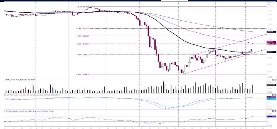
DFM GENERAL INDEX - DAILY CHART