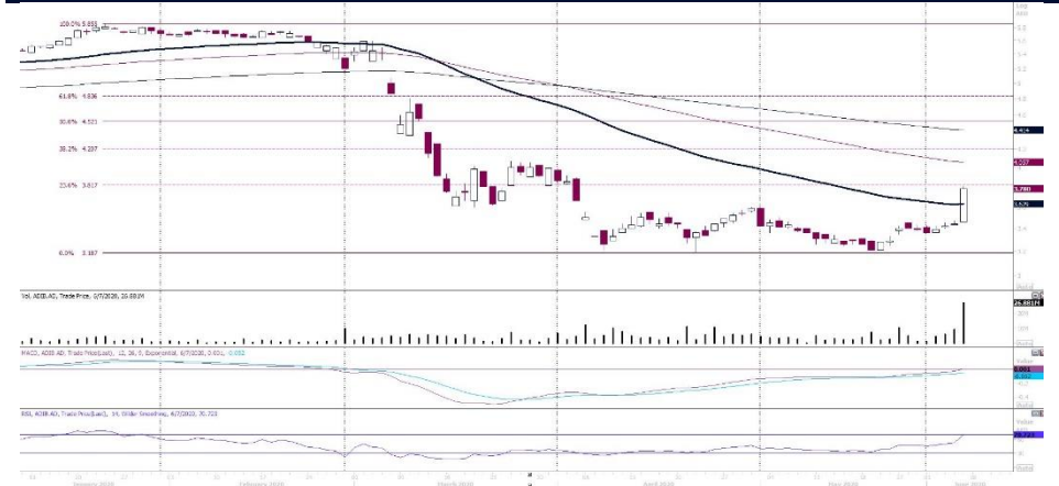
Abu Dhabi Islamic Bank - DAILY CHART

The Index has been strengthening even though it has been moving below its moving averages.